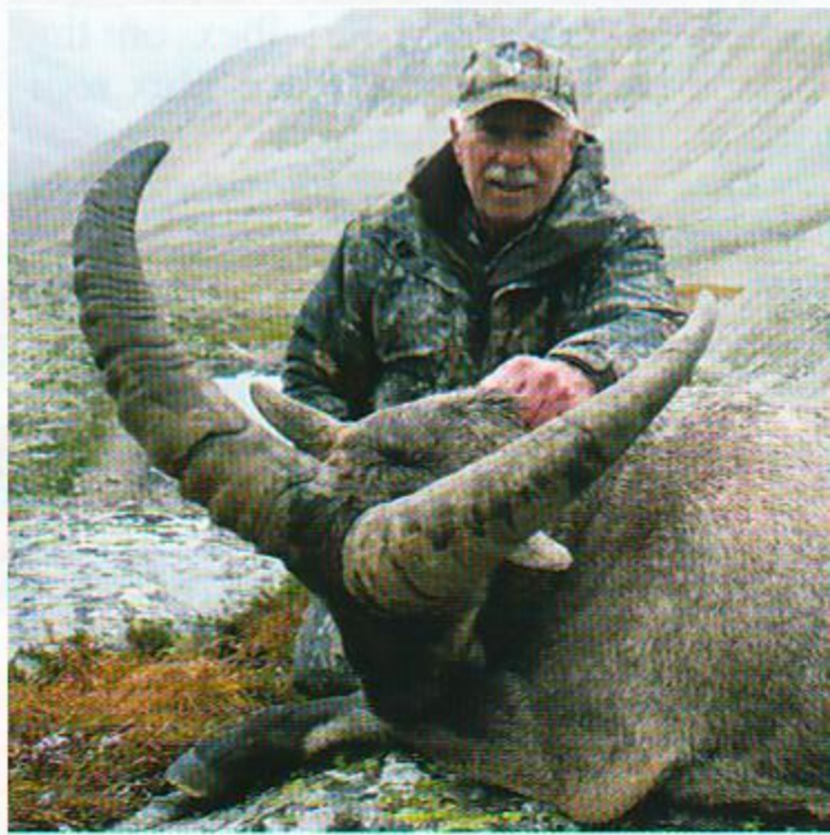
This Kuban (Western) tur was taken in Russia by George Harms, September 2008.